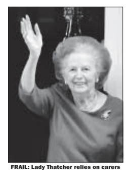
FRAIL: Lady Thatcher relies on carers