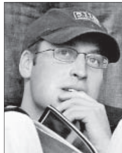
IN FOCUS: Prince William's spectacles

AS IF LOSING his hair wasn't ageing enough Prince William is now having to wear glasses on a more regular basis prompting speculation that his eyesight is deteriorating. The Duke of Cambridge was photographed last weekend wearing a pair of spectacles while taking a stroll through the grounds of Holyrood Park in Edinburgh, following his cousin Zara Phillips's wedding. "Normally William wears his specs just for driving his car or flying helicopters but now he is wearing them when he goes out for a walk which would seem to be an indication that his vision is worsening," I am told by one of William's friends. "It is unfortunate that he is not even 30 yet is already showing signs of premature ageing by losing his hair and having trouble with his sight." The last time William was seen publicly wearing glasses was when he and wife Catherine went to see the film Bridesmaids at their local cinema in North Wales, just after they returned from their tour of North