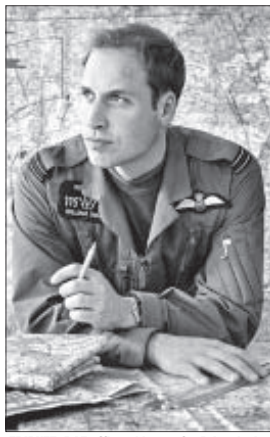
TRIBUTE: RAF officers' hopes for Prince's day

not be able to muster an impressive flypast. They are rightly proud that William has made Search and Rescue his chosen speciality and he loves the RAF." Indeed William, who will be based for the next three years at the Welsh island of Anglesey (and will continue to live with Kate in a nearby farmhouse) has chosen to be married in his blue RAF uniform although he is also entitled to wear the officer's outfit of the Household Cavalry, with whom he did his cadet training at Sandhurst. "We can't say exactly how many Sea Kings are in this country," says a Defence ministry spokesman, "and we cannot comment on any arrangements for a flypast."