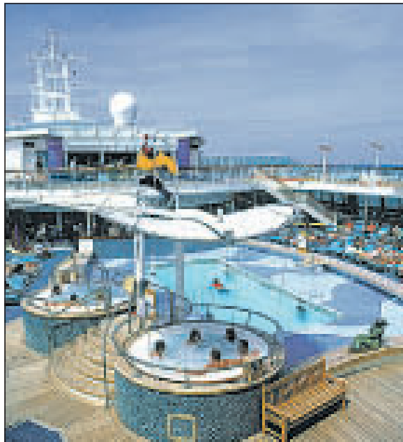
DECK DELIGHTS: On board Brilliance of the Seas