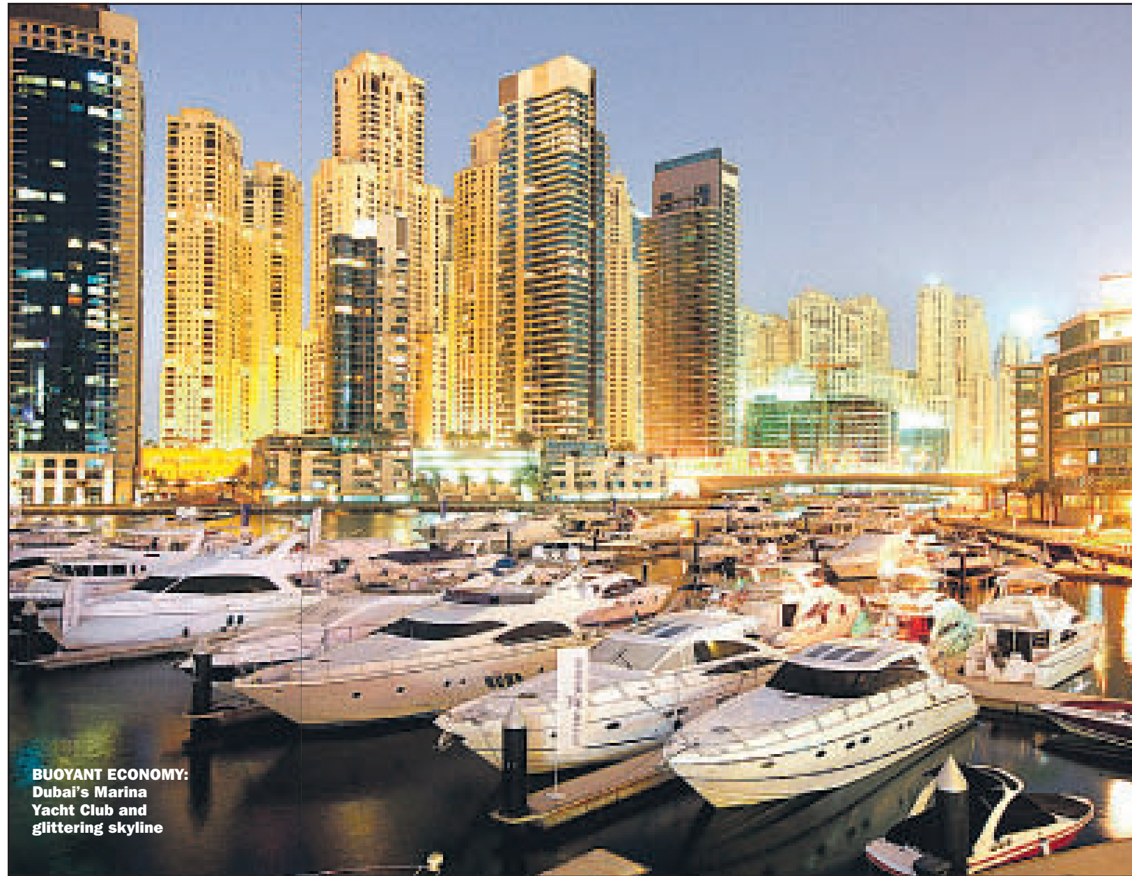
BUOYANT ECONOMY: Dubai's Marina Yacht Club and glittering skyline

The ship sailed smoothly through the night before arriving in Oman, a beautiful and verdant oasis where the people always seem to smile. Much has changed since the present, Sandhurst-